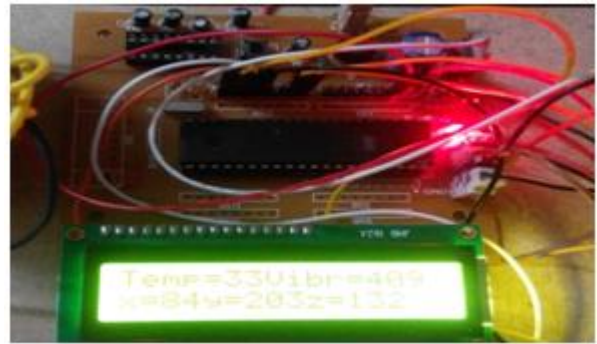
Fig.2. Sensor values on Slave.

The total system is divided into 2 parts, the first part is the considered as a slave circuit which will continuously monitor the sensor data as show in fig.2 and transmits the data over the zigbee network, which will be received by the master and displayed on the Qt GUI as shown in fig.3. These data will be continuously and appropriate priority will be allocated according to the threshold values set in the programming.