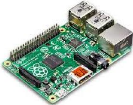
Fig.1. Raspberry Pi Board.

Pi is based on the Broadcom BCM2835 system on a chip (SoC), which includes, Video Core IV GPU, RAM of 512 MB. The system has Secure Digital (SD) socket for boot media and persistent storage. A SoC consists of the hardware, described above, and the software controlling the microcontroller, microprocessor or DSP cores, peripherals and interfaces. The design flow for Soc aims to develop this hardware and software in parallel as shown in Fig.1.