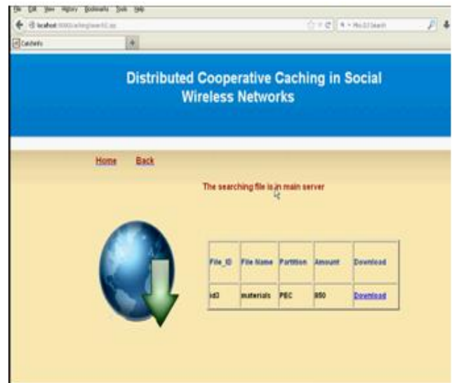
File 5: File Download