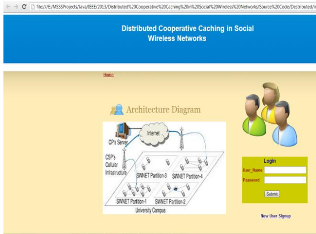
Fig2: Login Page