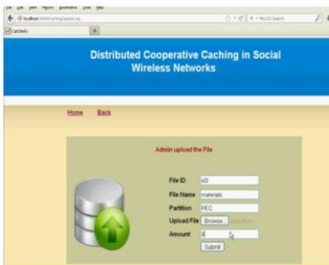
Fig4: File upload